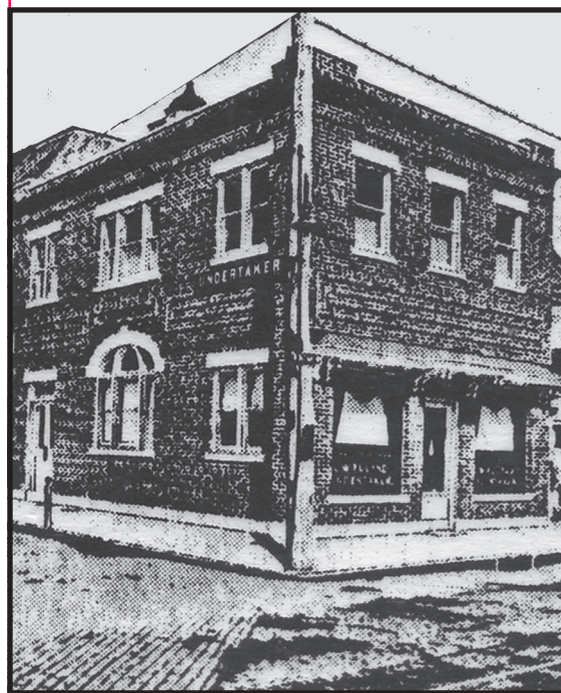
Photo of the Reese's 1900 building taken in 1914. Note the trolley tracks in the foreground. Trolley cars ran down South Ocean Avenue to The Great South Bay.

"May the wind be always at your back, May the sun shine warm upon your face, The rains fall soft upon your fields And until we meet again, may God Hold you in the palm of his hand."